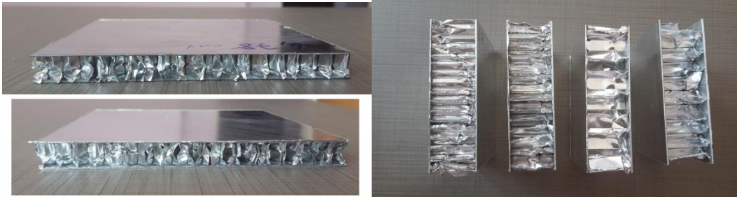
Figure 2. Experimental results the changes occurring in the samples

cell width increases and values increase when cell width decreases. Figure 2 shows the change in the shape of the sample after experiment, both in the device and separate from the device.