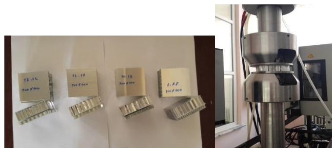
Figure 1. The produced samples and connecting it to samples of the test device