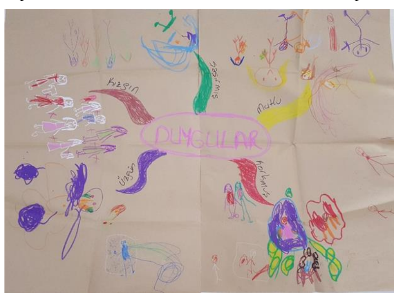
Figure 2. "Emotions" Mind Map

From week 6, the MM-SSAP were performed by combining 2 pieces of Kraft paper and small group studies were conducted with 4-5 students. Similarly, peer learning in small groups was encouraged. In addition, 19 activities were carried out based on the following subthemes: waiting for your turn, positive peer relationships, knowledge of oneself, expressing own feelings with positive behaviours, coping with anger, self-control, listening, completing tasks, conformity with changes, accepting results, problem solving skills, relationships with adults, goal setting, respect for diversity, emotions, empathy, solidarity, showing acceptance and rights. A mind map with the theme of "Emotions" is shown as an example in Figure 2