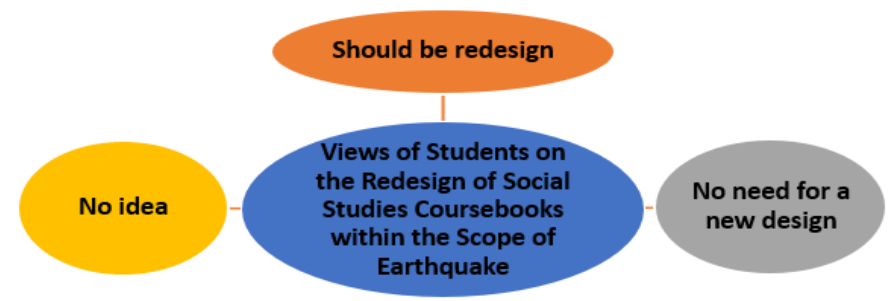
Figure 4. Views of Students on the Redesign of Social Studies Coursebooks within the Scope of Earthquake

In the study views of students on the redesign of social studies coursebooks within the scope of earthquake was researched. The findings obtained in this context are shown in Figure 4.