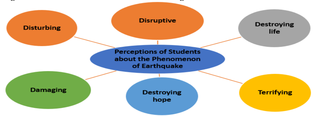
Figure 1. Perceptions of Students about the Phenomenon of Earthquake

In the study, the perceptions of students about the phenomenon of earthquake was researched. The findings obtained in this context are shown in Figure 1.