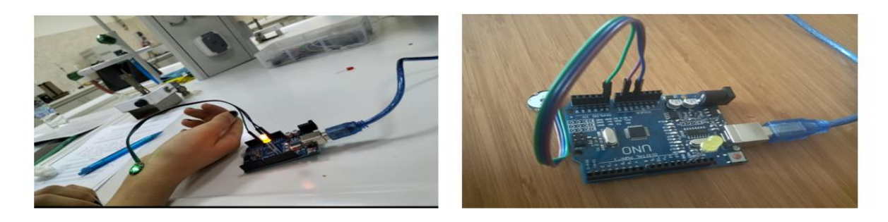
Figure 4. Some photos of Light Station

The aim of the light pollution activity is to raise awareness of the effects of light on sleep quality and the design of a night light to reduce unnecessary use of light. For this purpose, the study group was given a scenario. The scenario is briefly as follows: "L, who chose science for the project, wanted to work on light pollution. There could be both light pollution and adverse effects on human health if people left their night lights on while they slept. So L decided to design a night light". At the end of the scenario, the question "How do you think L can design a night light to prevent unnecessary use of light? The study group was asked to identify the problem situation and conduct research. After that, the Arduino Uno kit and the pulse sensor were given to the group. As a result, a lamp system was designed that can be switched off according to the pulse level during sleep and switched on when waking up (Figure 4).