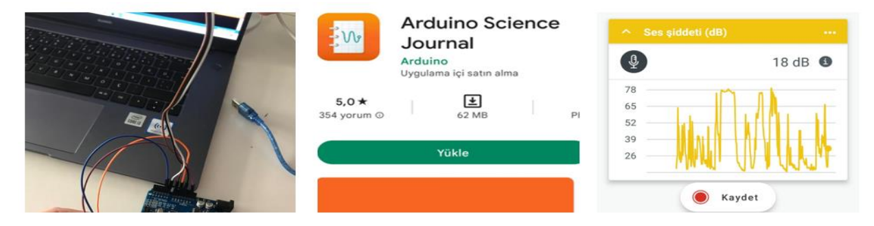
Figure 5. Some photos of Sound Station

was then given an Arduino Uno kit and a pulse sensor. The material was designed. Since the sound sensor designed for Arduino could not make accurate measurements, the sound level was measured simultaneously with the pulse sensor using the 'Arduino Science Journal' application, which can be easily downloaded to the phone (Figure 5). As a result of the measurements taken in different environments, it was found that the pulse value increased as the noise increased, and the pulse level became normal as the noise decreased.