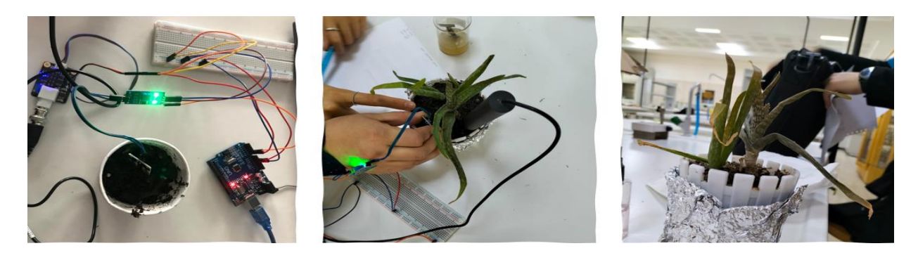
Figure 3. Some photos of Agricultural Station

As a result, the soil in which chemical fertiliser was used turned into an acidic environment in terms of pH and yellowing and drying of the plant was observed.